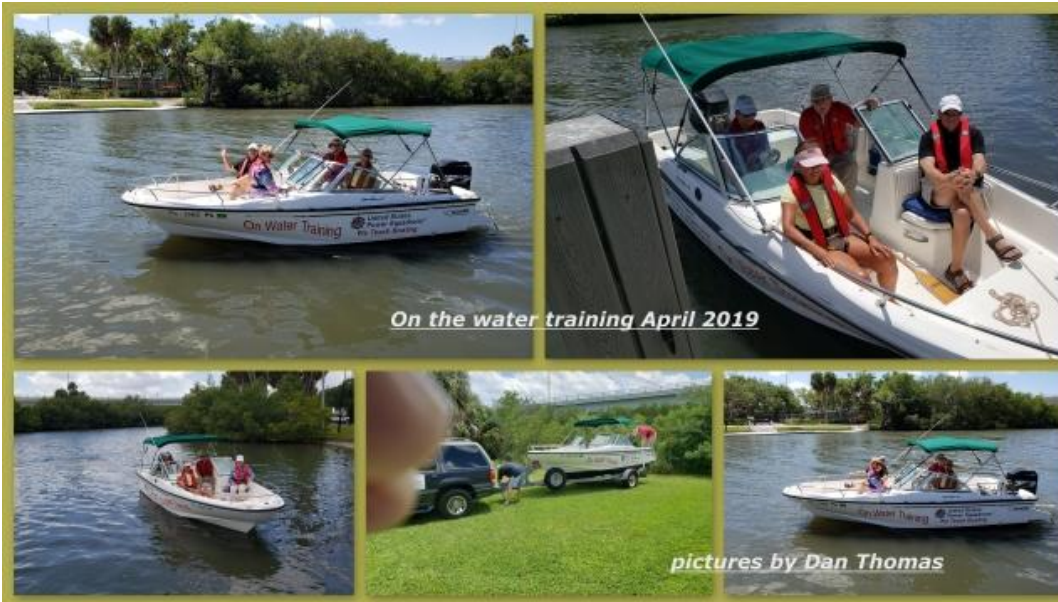
On the water training April 2019