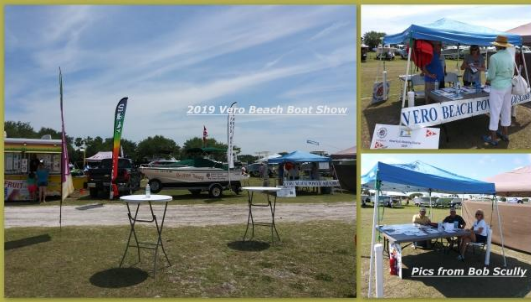
2019 Vero Beach Boat Show